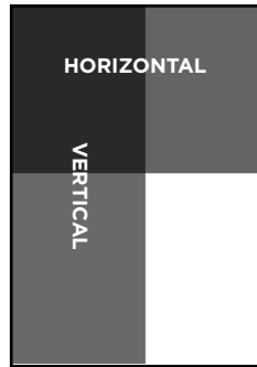
1/2 Page Ad H7.875" x 4.9375" V3.875" x 10.125"