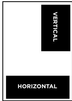
1/4 Page Ad H7.875" x 2.375" V3.8125 x 4.9375"